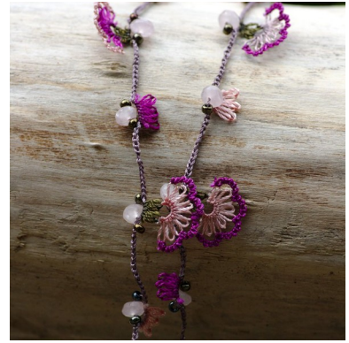
Fatoş Doğan (Schmuck)