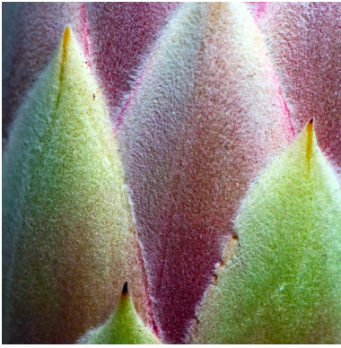
Matthias Grocholl (Photographie)